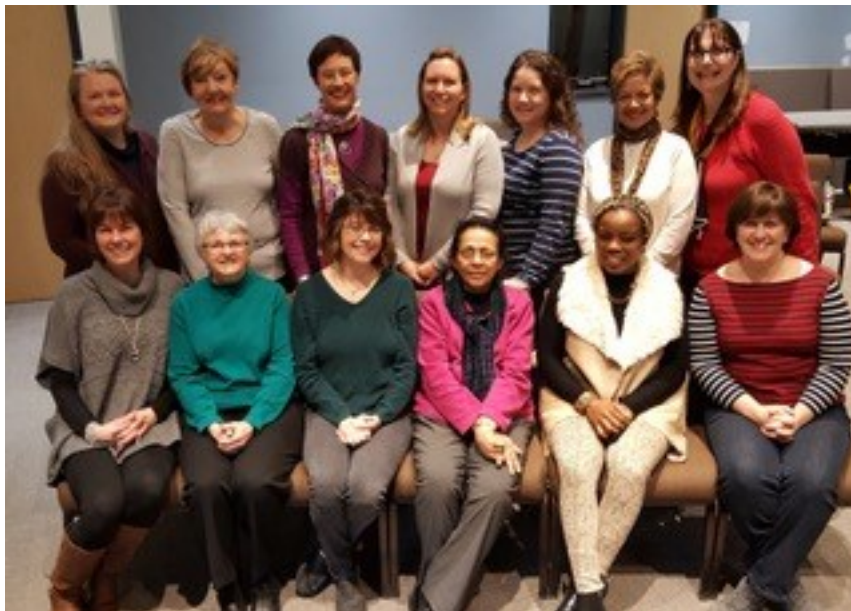
Newmarket Day Leaders Council

Therefore confess your sins to each other and pray for each other, so that you may be healed. The prayer of a righteous man is powerful and effective. James 5:16